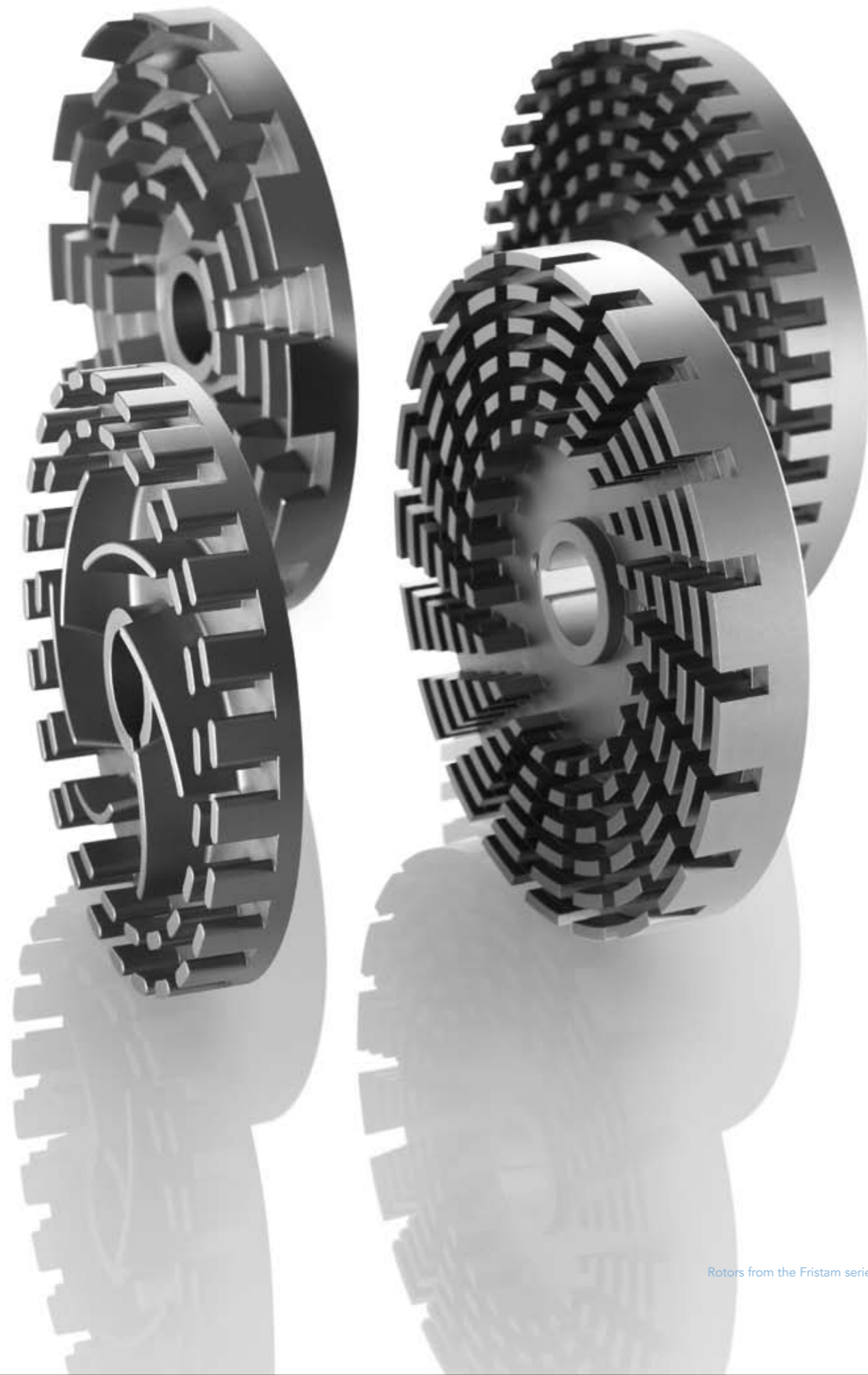
Rotors from the Fristam series FSP